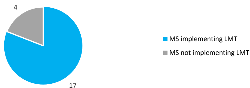
Graph 1 – Implementation of LMT in EU Member States

Most Member States 9 have LMT in place, and many of them reported exemptions in the implementation of the LMT. Reported exemptions are based on different social, economic or professional categories, for an example, third-country nationals whose employment derives from the implementation of international or bilateral agreements are exempt from LMT in three Member States. 10 Some of the reported exceptions also include educational professions, 11 professional performers, 12 sports professionals, 13 carers, 14 third-country nationals whose remuneration exceeds a certain amount, 15 persons of foreign interest, 16 highly qualified third-country nationals, 17 deficit professions/labour shortages. 18 Germany emphasized that LMT is implemented only in particular cases since the Skilled Immigration Act abolished LMT for many qualified jobs, also it was noted that the nationality of the third-country national might play an important role in the LMT applicability. The Netherlands reported that the applicability of the LMT depends on the purpose and the duration of the stay, and Finland added there are other exempted categories.